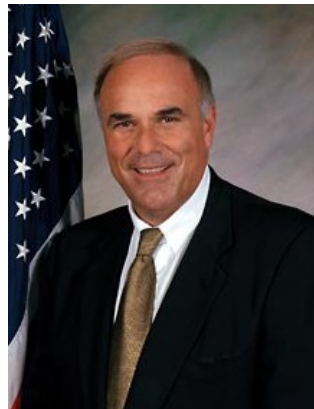
Edward G. Rendell Governor of Pennsylvania